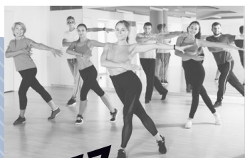
JAZZ Mondays 8:15-9:00

We will continue to run ALL of our adult classes, in 6 week session increments. Our first official session will be November 12-December 21. Cost will be $10 per class, or you can purchase a 10 class card for $75. Class cards can be used for ANY combination of 10 classes! Class cards will expire on 12/21/18.