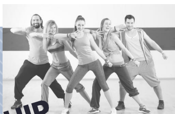
HIP HOP Wednesdays 7:30-8:15