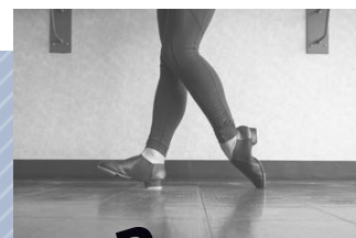
TAP Thursdays 8:15-9:00